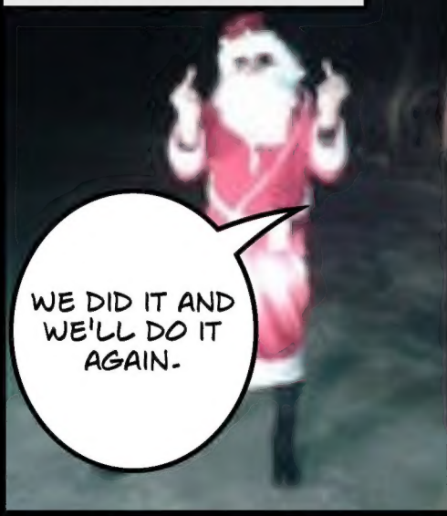
MEANWHILE AT VARNA HACKING GROUP HQ